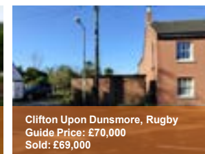
Clifton Upon Dunsmore, Rugby Guide Price: £70,000 Sold: £69,000