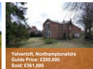
Yelvertoft, Northamptonshire Guide Price: £350,000 Sold: £361,000