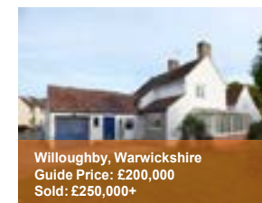
Willoughby, Warwickshire Guide Price: £200,000 Sold: £250,000+