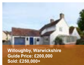
Willoughby, Warwickshire Guide Price: £200,000 Sold: £250,000+