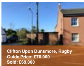
Clifton Upon Dunsmore, Rugby Guide Price: £70,000 Sold: £69,000