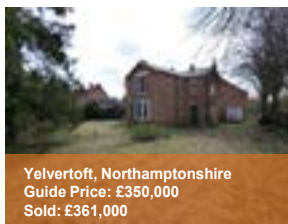
Yelvertoft, Northamptonshire Guide Price: £350,000 Sold: £361,000